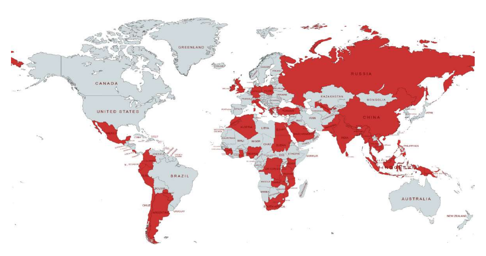
"Navigating The Pharma Landscape Together"